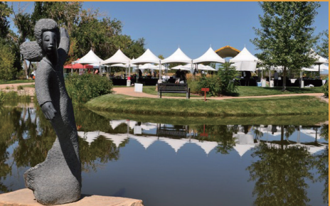
The Great Lawn at Chapungu Sculpture Park can be rented for weddings, receptions, corporate gatherings and fund-raising events. Visit the website at www.chapunguatcenterra.com or call 970.962.9990 for rental details.